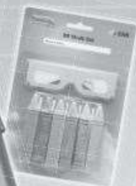
3D Chalk Set

Did you know that approximately one in five parents are trying to teach their children about cashless transactions and digital money management? CommBank research shows parents are alternating between cash and online bank transfers when giving their children pocket money, and actively demonstrating 'tap and go', online banking, mobile applications and how ATMs work. For more information and tips on financial education for kids, visit The Beanstalk on commbank.com.au/beanstalk